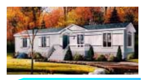
...it is easier for a park model trailer to be classified as real property than it is for a mobile home

However, in determining whether a mobile home is real property and whether a park model trailer is real property, there are a few differences to note. The differences between the two laws are shown below in bold type.