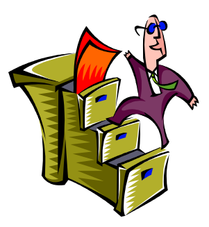
Other states have implemented similar electronic filing provisions with no difficulty in enforcement or collections.