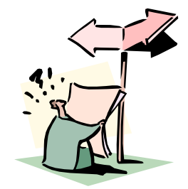
The Comparison Report is designed to serve as a starting point for the administrator or decision-maker.

Nearly 50 percent of counties are experiencing a flat or reduced budget level while many are managing continued growth in parcels and workload."