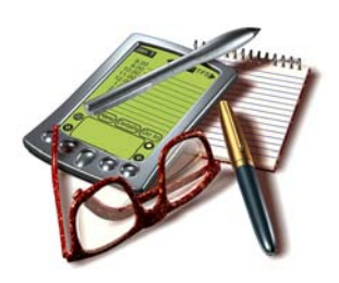
Our goal is to review levy calculations in all counties within the next two years.

"We have made the decision to change the manner in which we are conducting our levy reviews.