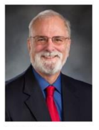
Sen. Phil Fortunato (R-Auburn)