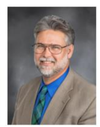
Rep. Ed Orcutt (R-Kalama)