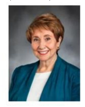
Sen. Lisa Wellman (D-Mercer Island)