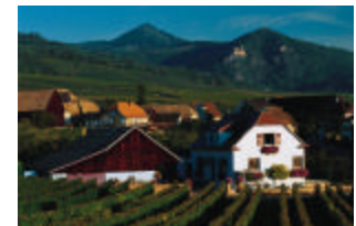
A benefit assessment is a charge or a fee derived from benefits received by property.

"The Washington State Constitution requires all taxes on real estate to be uniform within a taxing district."