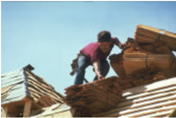
Installing a new roof requires a building permit in most jurisdictions and is considered new construction.

(Part 1 of an ongoing series regarding New Construction and "Improvements to Property")