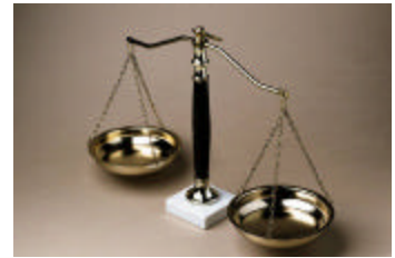
One of the Department's goals is to promote fairness, consistency, and uniformity in the development and application of tax law and policy.

application of tax law and policy. As part of our continued effort to provide clear and consistent guidance on issues of property taxation, the Property Tax Division has recently formed a workgroup to study issues of new construction and improvements to property. We hope to provide stakeholders with timely and accurate information and welcome your feedback. ♦