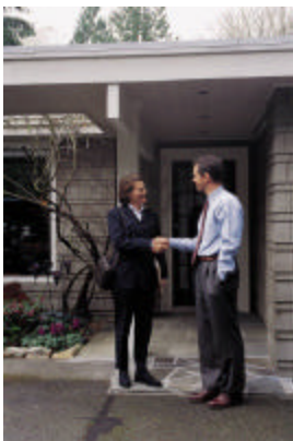
The County Assessor shall make a physical appraisal within 12 months of the issuance of a building permit.