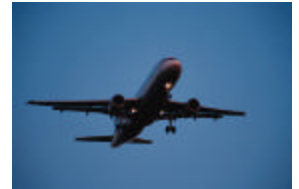
A B&O tax credit is available for property taxes paid on qualifying property used in manufacturing commercial airplanes or component parts of commercial airplanes.