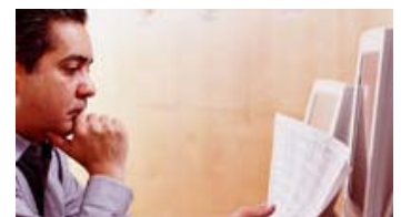
The first year the credit may be claimed is 2005.

“Anyone claiming the credit must submit an annual report to the Department of Revenue...”